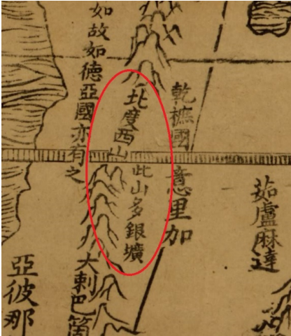
Figure 2: Close-up of Potosí.

There is one more description mentioning gold and silver production. It is located in eastern Africa around the equator and states among others that this place does not produce iron but gold, silver and ivory. 53