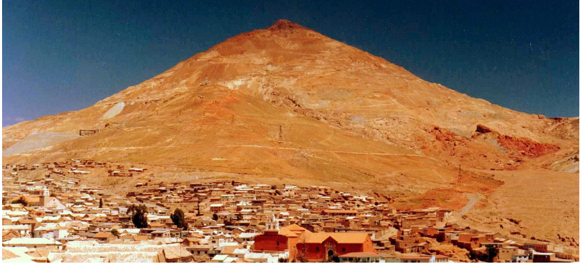
Figure 3: Potosí and the Cerro Rico. Note: The KYGZ's description is in reasonable agreement with the Cerro Rico's size, shape, and color.

Bry's Peregrinationes . 140 Finally, the shape of the Cerro Rico, the silver mountain of Potosí, matches exactly the description in the Kunyu gezhi (see Figure 3).