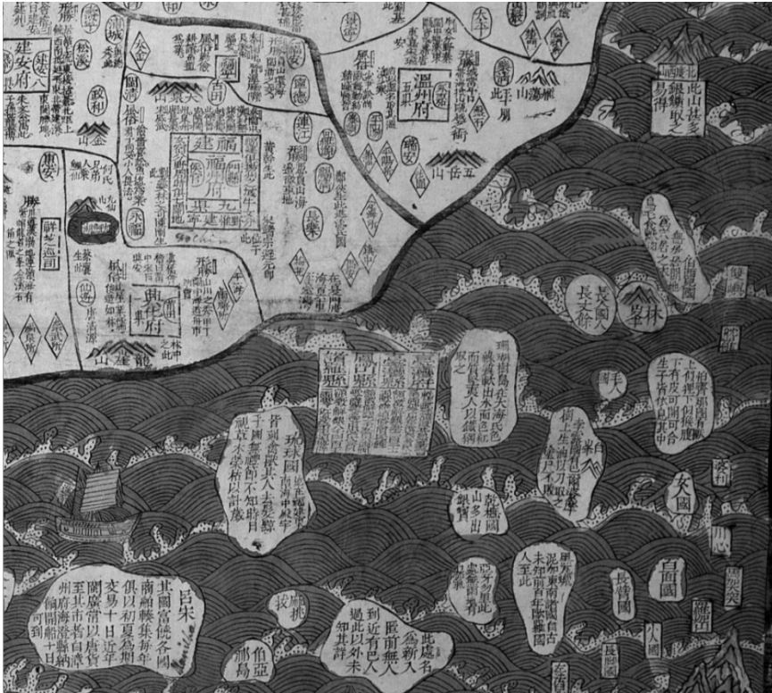
Fig. 2 Section of an untitled map dated 1743, based on Matteo Ricci's Kunyu wanguo quantu . 184

tion “Borders” 邊裔典. 181 Two other geographical works, Da Ming yitong zhi 大明一統志 (Records of the Unity of the Great Ming; 1461), 182 compiled under the directorship of Li Xian 李賢 (1408–1467) and Peng Shi 彭時 (1416–1475), and Da Qing yitong zhi 大清一統志 (Records of the Unity of the Great Qing; 1790), an imperial geography and description of the Qing empire, both mention St. Thomas, Peruvian and Brazilian balsam oil (聖多默巴爾撒木油, 壁露巴爾撒木油, 伯肋西理巴爾撒木油) as a product of the Europeans (lit. Western oceans). 183